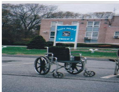
Westbrooke 1000 Wheels Day 2008 State Police Department

We are an all volunteer organization and always looking for new friends. Any amount of time you can give is always appreciated no matter how small. Splitting the day at a Barrack or sharing the time and making new friends. Do you have a truck? Picking up chairs and returning them to the garage in Bloomfield is extremely helpful. Please contact me at sgf@chariotsofhope.org